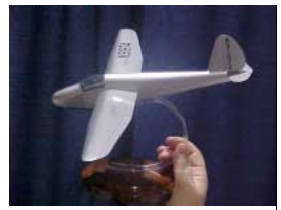
This beautiful model of the Schweizer 1-23 #9 will be raffled off during the seminar in June. Presently the model is on display at the Soaring Museum at Harris Hill. Raffle ticket will be on the home page for down-loading and are $2.00 each

Hangar Soaring 213 Anne Burras La. Newport News VA 23606-3637