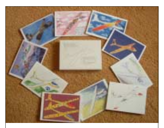
Order your cards today. They sell fast. Box of 10 with the story of the paper glider project on the back of the box. $12/box Send to address below and make your check out to WSPA

Thank you to Younameit Inc. who provided the boxes for the cards free of charge.